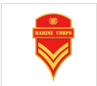
United States Marine Corps