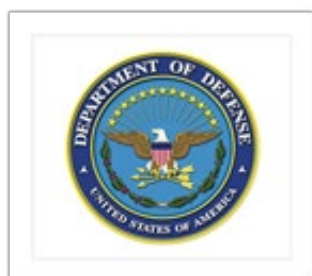
United States Department of Defense (DoD)