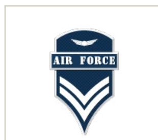
United States Air Force

“ The program trained me to look at every security incident from a different perspective – not as a technical professional but someone who belongs to the managerial level.