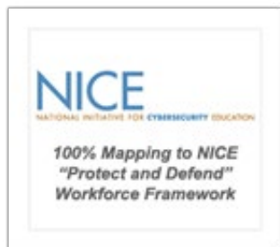
The National Initiative for Cybersecurity Education (NICE)