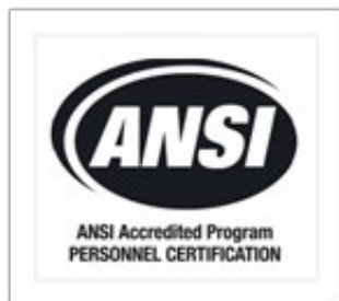
American National Standards Institute (ANSI)